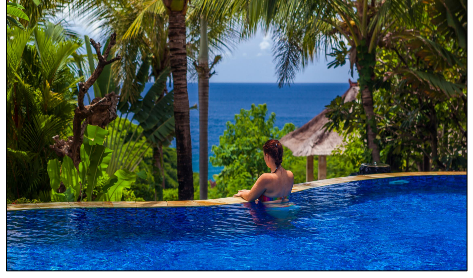
Only a two minute walk to the beach!!