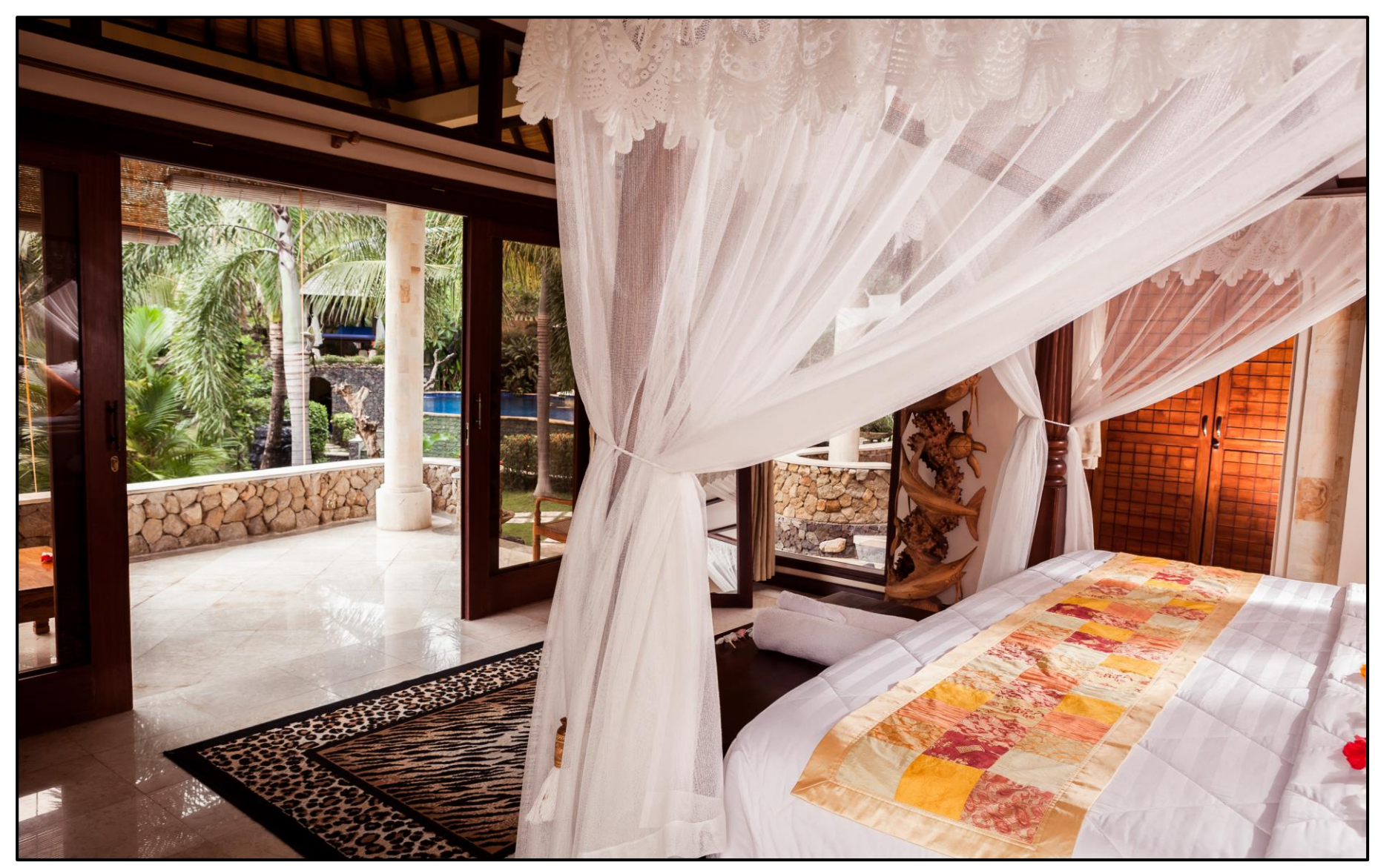
The property features a private pool, full kitchen, WiFi and satellite TV.